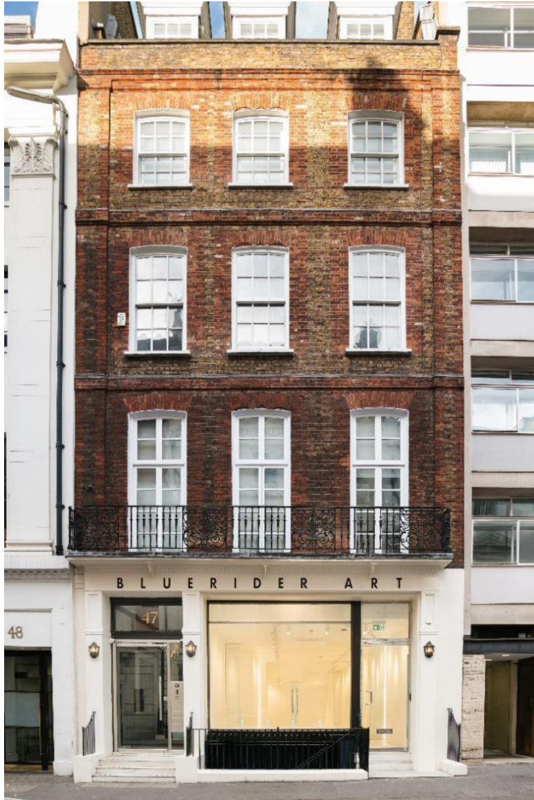
Bluerider ART, Mayfair