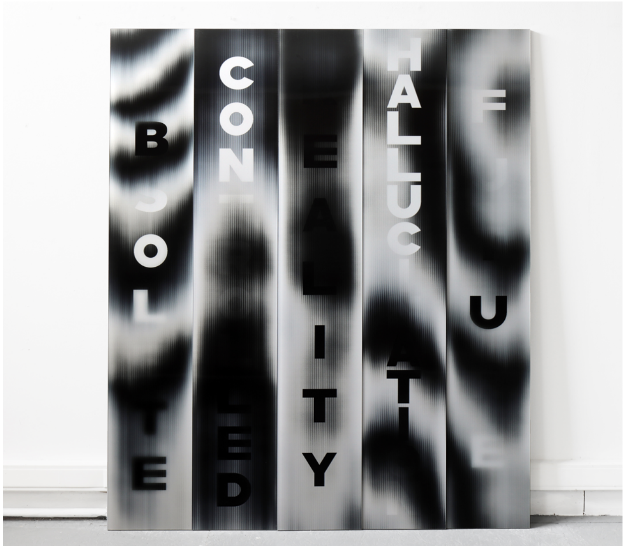
Pascal Dombis, Obsolete Future , 5 panels 1.50 x 1.80m total (each panel 0.30×1.80m), 2022, Lenticular print on aluminum composite, Unique 1

Bluerider ART seeks to create a platform for East-West exchange through its foundations in Taipei, Shanghai, and London. It offers high-quality professional collection services, explores the universal language that transcends time and space in art, and is committed to enriching the human spirit through art.