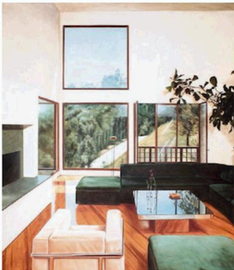
Paintings by Canadian artist Brian Rideout, beginning Sept. 21 through Oct. 13.

refuse of the urban landscape, she also becomes part of it — that marble slab or wooden block are actually made from foam and resin. And though she works with "junk," the show is set up to be minimalist and contemplative, not junky at all. Sept. 7 through Nov. 2.